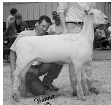
Grand Champion Ewe at the 2008 Ohio Southdown Classic sold from Wisconsin to Pennsylvania for $9,500.

Futurity Ewe lambs will be designated with an "F" paint brand at the top of the shoulder