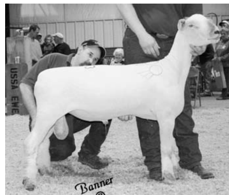
Grand Champion Ram sold from Minnesota to Pennsylvania for $5,750 at the 2008 Ohio Southdown Classic.